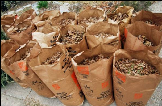
2018 CURBSIDE LEAF PICKUP Month of November

The City will continue its fall curbside leaf bag collection program beginning