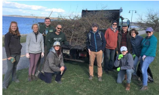
The invasive species crew, directed by Audubon and Portland Parks, removed a lot of bittersweet and multiflora in the mid-slope area.

Unfortunately, one big source of trash was a large debris field containing hunks of heavy cardboard tubes, apparently left over from a February fireworks display.