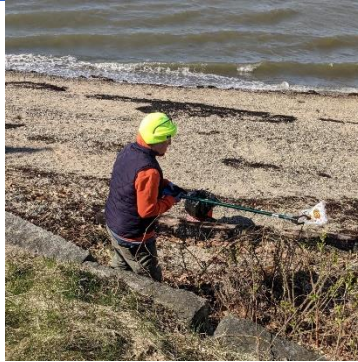
The haul ranged from cigarette butts to entire bags, Some were heard to mutter while picking "the earth is not your ashtray!"