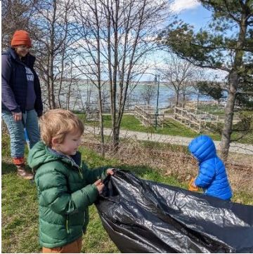
Blustery winds made trash bag control a challenge, but this family quickly perfected their trash picking technique.