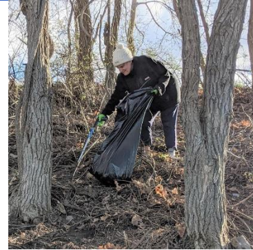
A Quebec Street neighbor, dressed for the spring chill, went off-trail to reach every scrap.