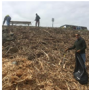
Some volunteers found a lot of trash to pick on the slope below the lot where food trucks ply their wares.