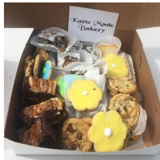
Katie Made Bakery made a delicious donation to Earth Day Volunteers again this year!