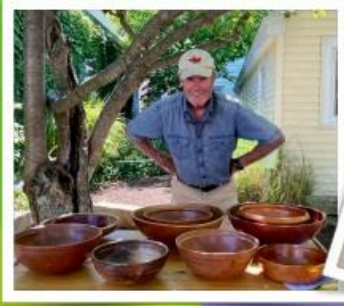
Tom Woodruff Native Hardwood Bowls