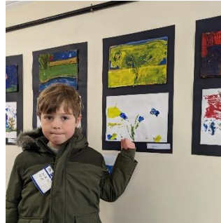
Enda, 2, collagraph, tree with bird