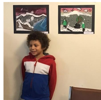
Artist Zyan, Grade 2, layered landscape (Zyan's creation is not pictured)