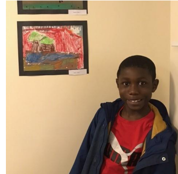
Believe, Grade 2, layered landscape, volcano with snow