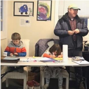
Inspired kids made their own art while others viewed the show.