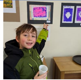
Jesse, Grade 5, gel print, foxes