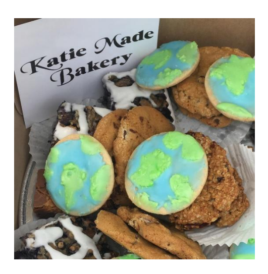
Lucky volunteers might be able to snag a favorite frosted Earth Day cookie!