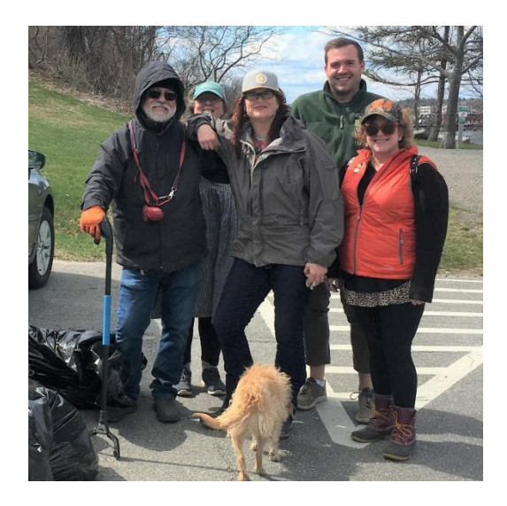
A few of the Earth Day 2022 volunteers, likely to help out again this year. Please join them!